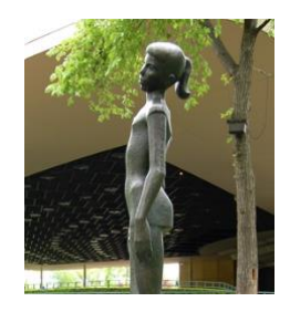
Ravinia's Sculpture Collection - FREE

Five optional tours will be offered throughout the weekend. <u>Learn more about each tour</u> including food options for Monday's tour and <u>updated availability status</u>. Tours include: