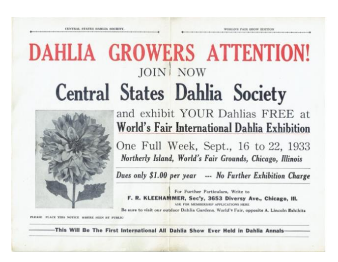
Ad from World's Fair Show Edition brochure

In both 1933 and 1934, CSDS sponsored a large dahlia garden in an area east of Chicago's Loop. While the first year presented challenges, adjustments in 1934 led to a much-improved display. After the World's Fair concluded, members saw an opportunity to continue fostering their passion for dahlias and decided to establish a lasting society.